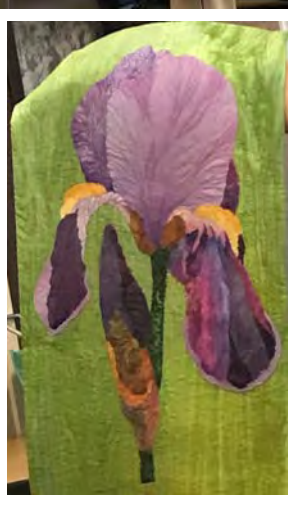
Show and Tell